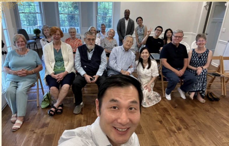
Adult Spring Concert - June 9, 2024